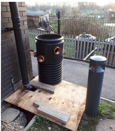
New signage has been supplied and installed at roof level and on the down pipes to hopefully make all aware of the water collection system

We have moved forward with the water attenuation from the Castle mill roof area – drainage checked, and new silt trap delivered – they are sealed connections so should not leak