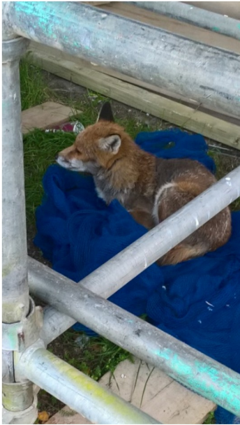
Mr Fox has taken up residence under the scaffolding

We have been on site for 33 weeks and progress has been good to date, we have scaffolded out 5 blocks which is approximately 400 tonne of materials which has been carried by hand from the road to the location